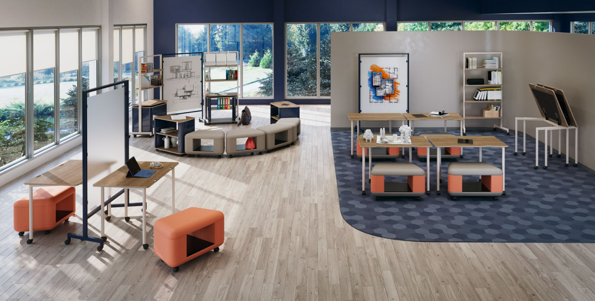
Structure without confinement