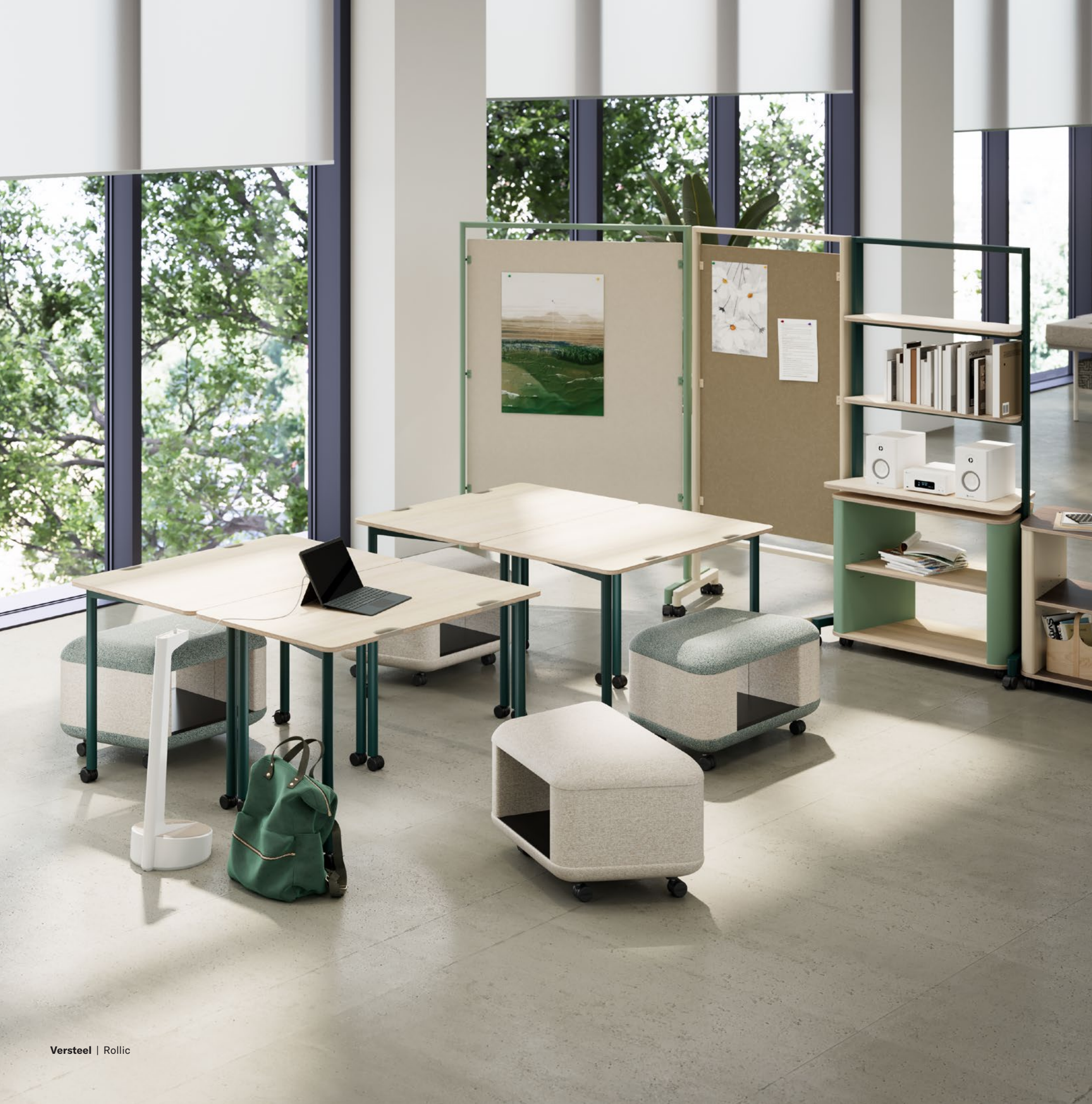
Mobile tables: design and function at its finest Flip-up top with urethane handles for flexibility PET on underside creates acoustical comfort