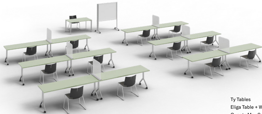
Ty Tables Eliga Table + Whiteboard Quanta Max Seating Acrylic Privacy Shields