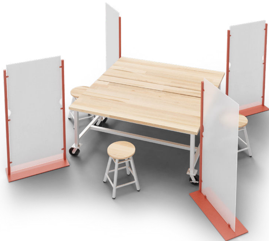
The Maker Project Freestanding Privacy Screens