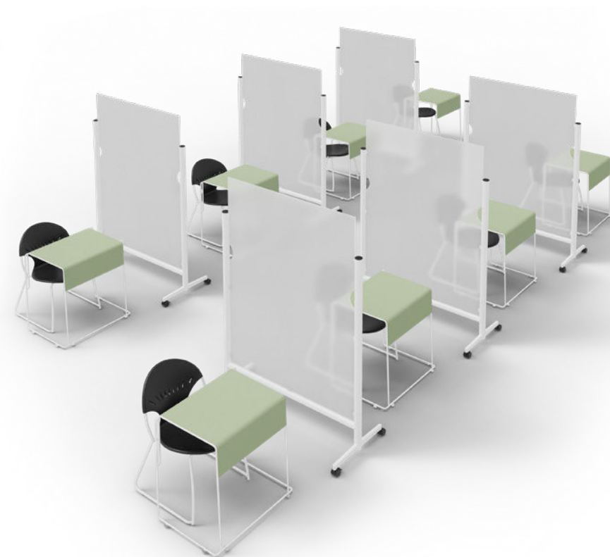
ODIS Tables Chela Seating Mobile Privacy Screens (Eliga)