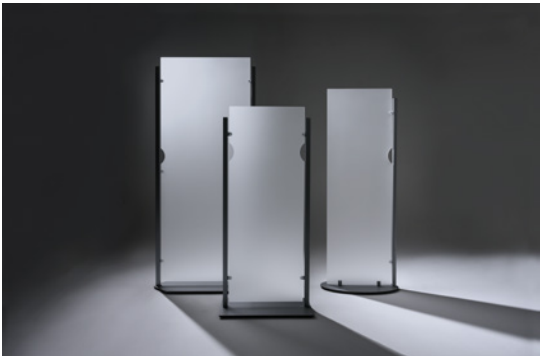
Freestanding Privacy Screens (single and double base styles)