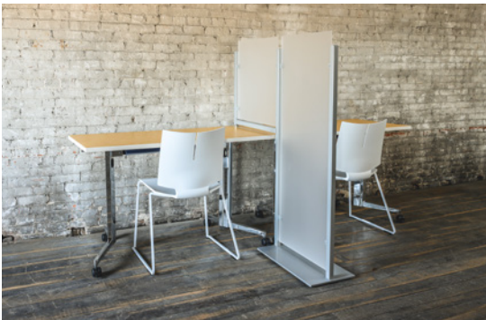
Freestanding Privacy Screens (with extension)