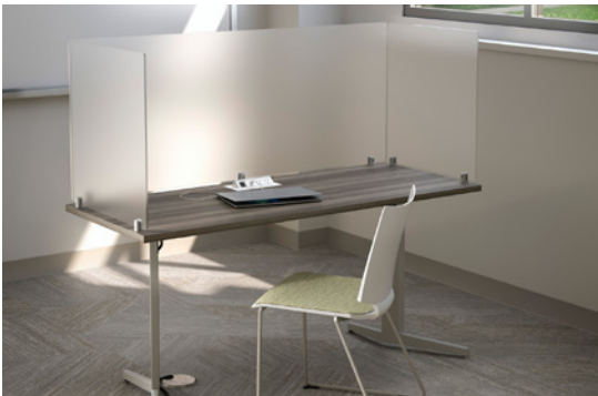
Acrylic Privacy Panels