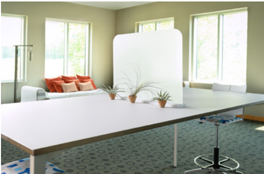
Acrylic Privacy Shields