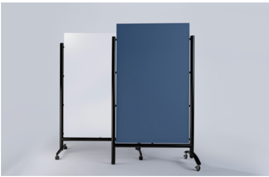
Mobile Privacy Screens