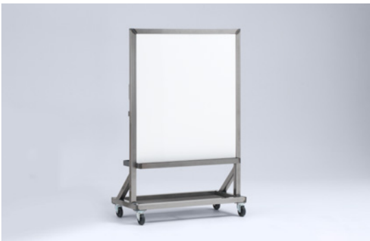
The Maker Project Whiteboard