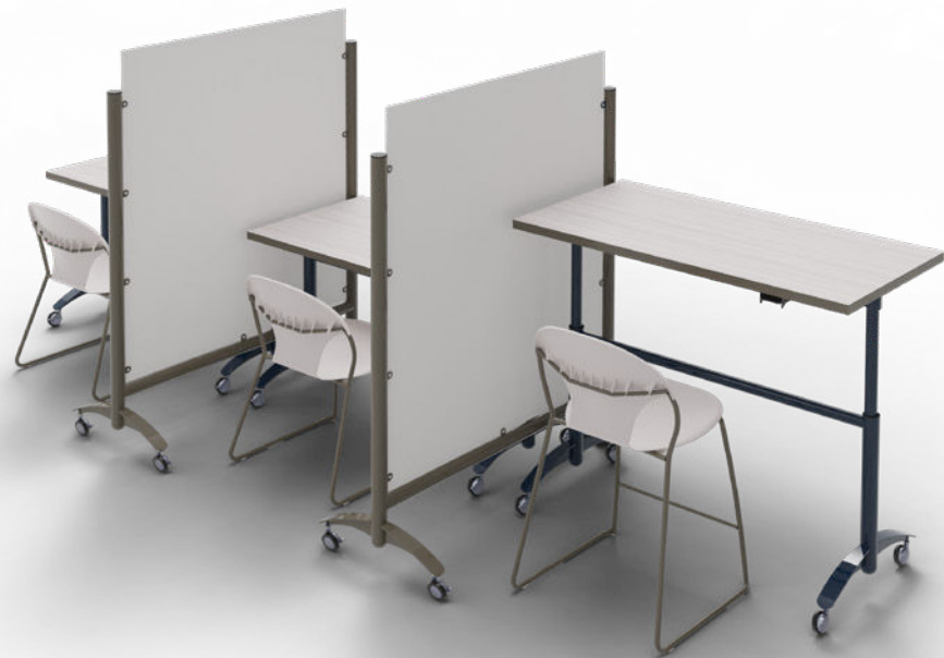
Sky Tables (Vela) Chela Seating Mobile Privacy Screens (Vela)

Many of our products were engineered with efficiency in mind: how can a space be adapted to accommodate safety needs with minimal disruption to the budget and space?