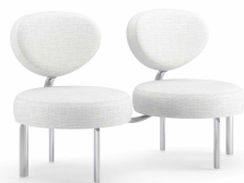
two seats 27D 51W 33H (seat height 18H) two ends with backs