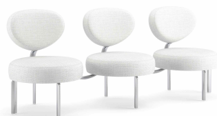
three seats 27D 78W 33H (seat height 18H) two ends and one middle with backs